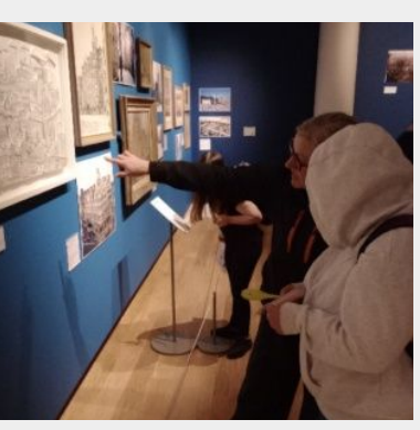
This week at V6F:

A group of students visited the New Walk Museum in Leicester and had a fantastic time looking through all the exhibits. They admired a whole variety of art, as well as learning about dinosaurs and Egyptians. Meanwhile, students at Middlefield Lane have been keeping fit and healthy with different games. Boccia is a particularly favourite among many of the young people.