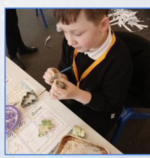
Cleveland House & THS Christmas party