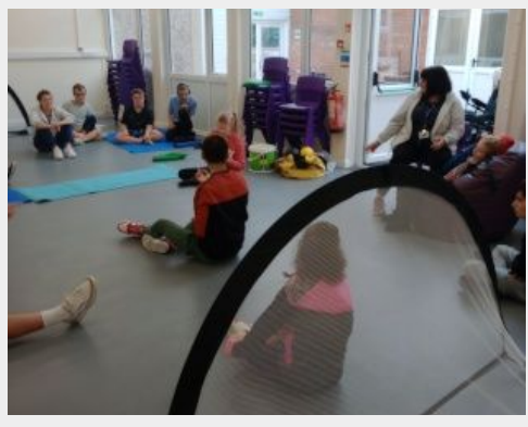
One group worked together to create a new game in their PE session. They decided how to use the equipment and trialed their game, helping each other throughout the session.