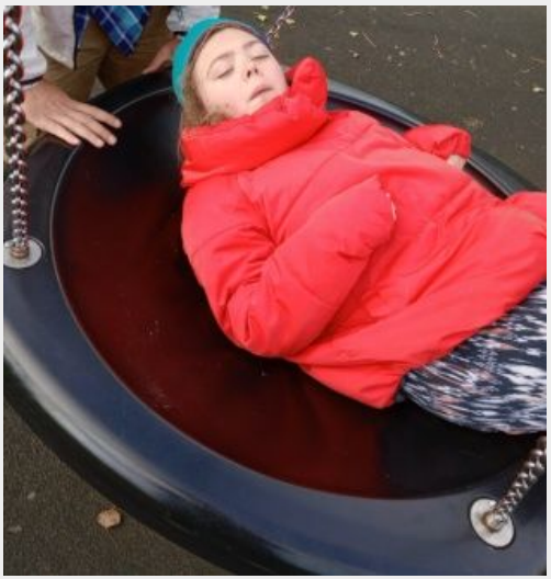
A group visited a local park to enjoy the equipment. They really enjoyed the fresh air and exercise.

Be prepared for going out into the community, especially when it is raining.