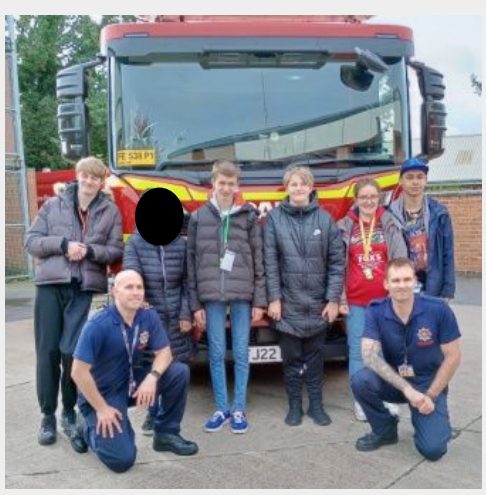
A group visited the fire station to learn about the work of fire fighters. They even had a chance to use the hose!