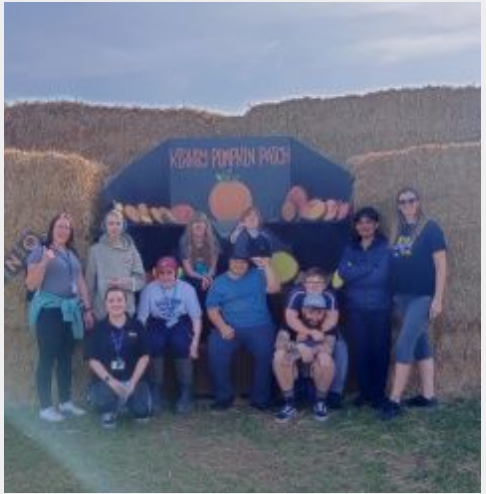
A group of students visited the Pumpkin Farm to see how pumpkins grow and are harvested.