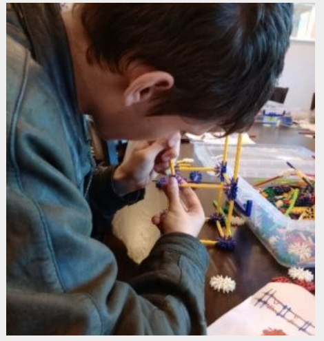
Some young people have started work experience placements - learning about many things such as constructions and teamwork.