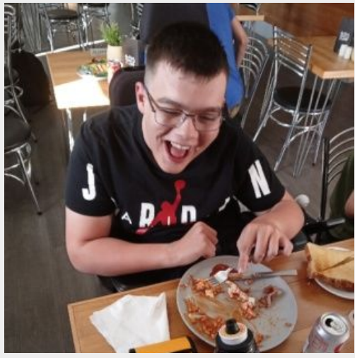
A group of students visited the Everyday Living cafe to enjoy a meal out and work on their communication skills.