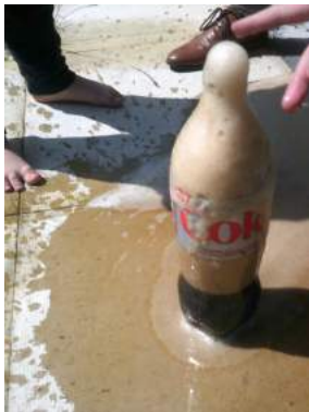
The coke exploded!

This week we have had a lot of fun whilst trying to keep up with our learning! We did a lot of silly experiments including putting Mentos into a bottle of Coke to see what would happen and putting kitchen roll into water with food colouring in - again, to see what would happen! This is what we found out: