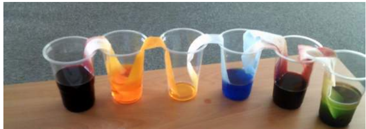
And the water walked!